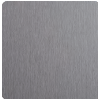
Brushed Aluminum - BAT