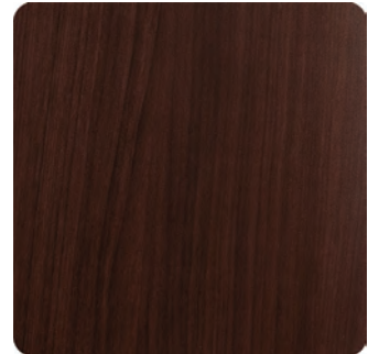
Elegance - ELT