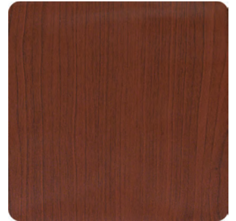
Clove - CLT