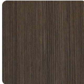
Baroque - BRT