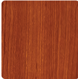
Hayward Cherry- HCT