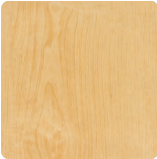
Fusion Maple - FMT