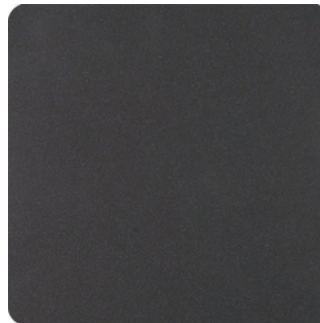
Shark Grey - SGT