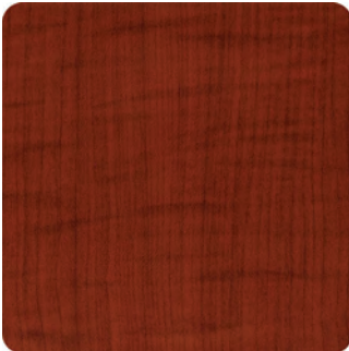
Crossfire Java - CJT