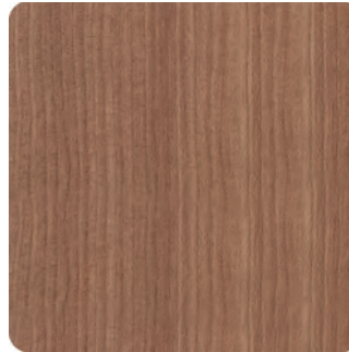
River Cherry - RCT