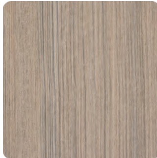
Aria - ART