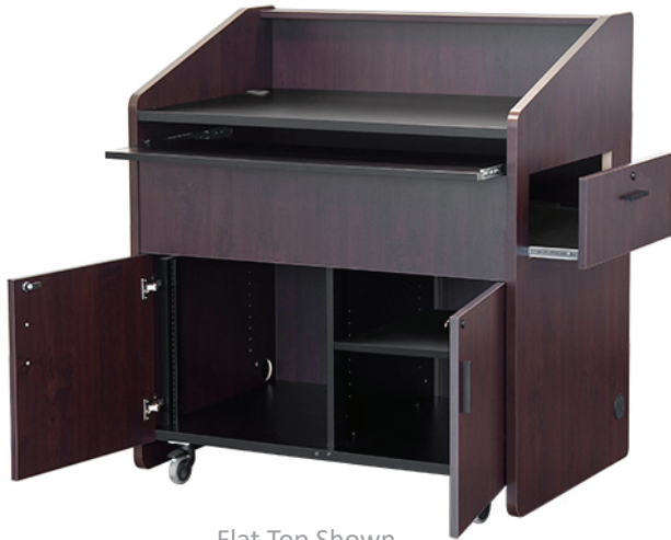
Flat Top Shown

Top rear removable, intended to easily be mounted in a wedge position or as flat large work surface, that can support monitors laptops and room control systems.