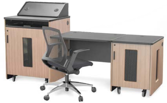
Components: PD5103, 5104TP & RK5106 Podium & rack with ADA compliant desk work surface 88.125"W x 30"D (30" height desk top)