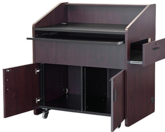
Flat Top Shown

Top rear removable, intended to easily be mounted in a wedge position or as flat large work surface, that can support monitors laptops and room control systems.