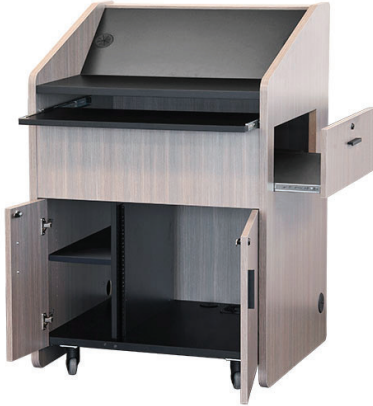
Console Top Shown

Top rear removable, intended to easily be mounted in a wedge position or as flat large work surface, that can support monitors laptops and room control systems.