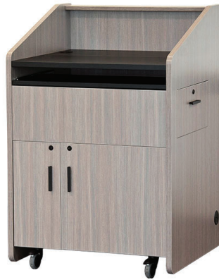
Flat Top Shown