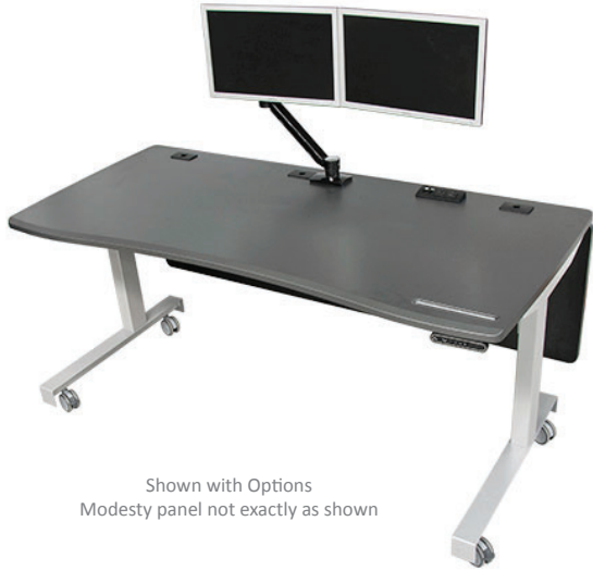
Shown with Options Modesty panel not exactly as shown

The DS6330-LFT is an adjustable height sit/stand desk ideal for high tech classrooms, lecture halls and corporate training sites. It features a large work surface with easily accessible power and grommets for electronics and charging devices. Powered by industry proven Linak® electric actuators with push-button height adjustment (28" - 52") and height readout LCD. Will adjust from sit to standing position with 3 user memory height settings.