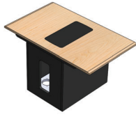
EXT32 Extension (+2 people) 48" W X 29" D X 29.13" H