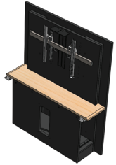
526RW-S/D/XL Section 48" W X 12.6" D X 62" H