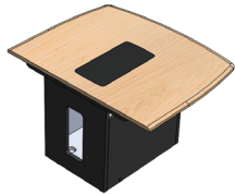
526RR Section 48" W X 37.71" D X 29.13" H