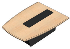
526FR Section 48" W X 67" D X 29.13" H