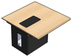
526SE Section 48" W X 46.5" D X 29.13" H