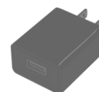
AC Power adapter Output: DC 5V, 2A

The charger comes with a 2m long USB cable, ready to plug into a transformer, computer, or hub.