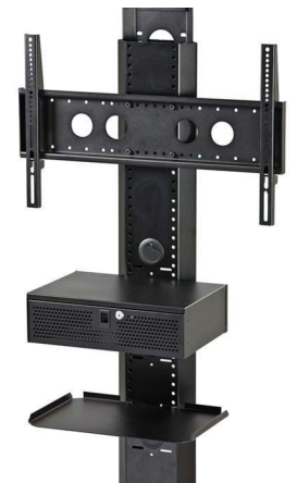
LB3 installed in a PM-S-FL (Sold separately)

The information contained in this drawing is the sole property of Audio Visual Furniture International. Any reproduction in part or as a whole without the written permission of Audio Visual Furniture International is prohibited. We can build or modify stock configurations to suit customer specifications. Please contact us to discuss how this service can help meet your needs. Some quantity restrictions may apply. Specification subject to change without notice. Computers, cameras, monitors, etc. are shown to illustrate product usage and are not included unless otherwise noted.