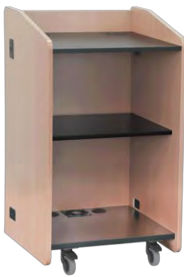
SH-LE installed on LE3060 Lectern (Sold separately)