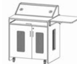
PD51 Mobile Station 36.5"W x 30"D x 47"H