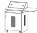
PD5103 Podium 29.75"W x 30"D x 47"H