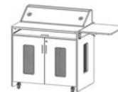
PD5107 Dual Rack Station 42.75"W x 30"D x 47"H