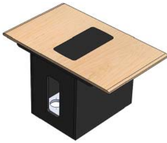
Code T526 EXT32 (Middle ∞ or End Against Wall)