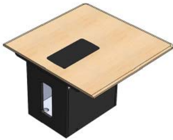
Code T526 526SE (Front and/or End)