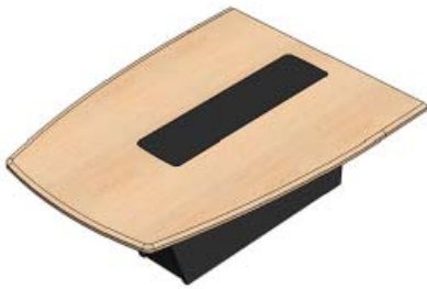
Code T526 526FR (Front and/or End)