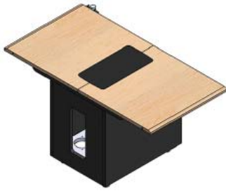
Code T3600 EXT42 (Middle ∞ or End Against Wall)