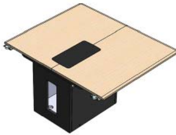
Code T3600 36SE (Front and/or End)