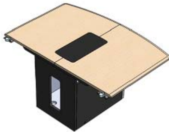
Code T3600 36RR (End Only)