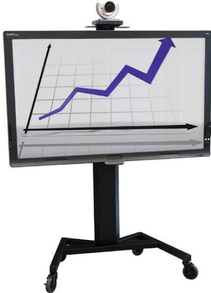
Shown with SMART Board® 8070i interactive display