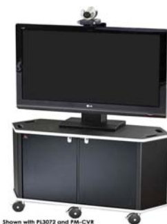
Shown with PL3072 and PM-CVR