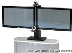
Shown with options PM-CVR and PM-CAM