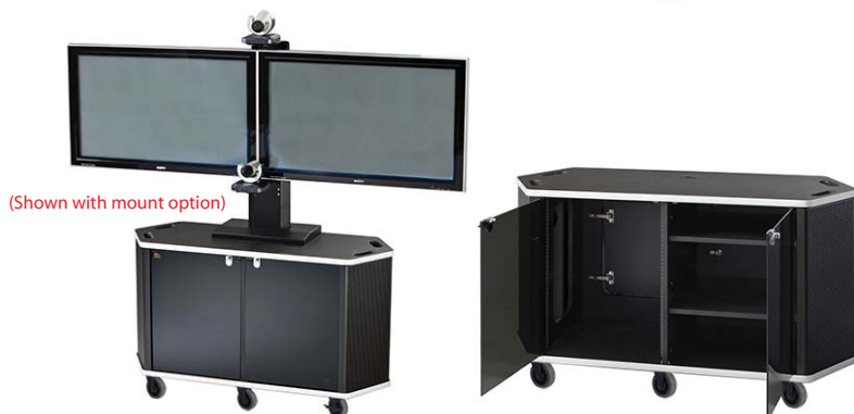
(Shown with mount option)

Perforated metal sides provide maximum ventilation for any electronics mounted in the standard 14RU rack rails as well as conceal mounts for up to 2 TOA panel mount speakers. The PL 3072's wider footprint adds stability for dual monitor configurations and internal space can be optionally configured as dual rackrail sides or dual shelves.