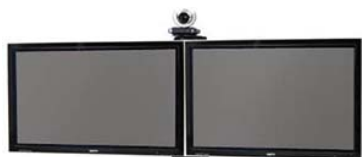
(Shown with mount option)