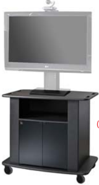
(Shown with mount option)