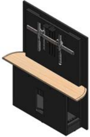
36RW-S/D/XL Section 56" W X 12.6" D X 62" H