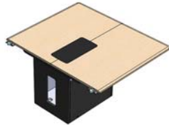
36SE Section 56" W X 46.5" D X 29.13" H