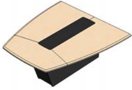
36FR Section 56" W X 63.5" D X 29.13" H