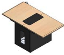
EXT42 Extension (+2 people) 56" W X 29" D X 29.13" H