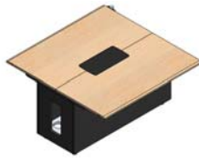
EXT44 Extension (+4 people) 56" W X 55" D X 29.13" H