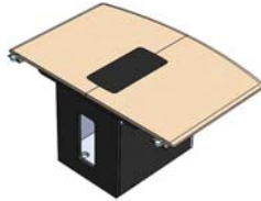
36RR Section 56" W X 37.75" D X 29.13" H