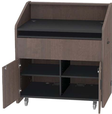
Flat Top Shown

New Feature: Top rear removable, intended to easily be mounted in a wedge position or as flat large work surface, that can support monitors laptops and room control systems.