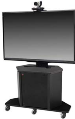
Shown installed on the PL3070 cart (sold separately)

The PM-S-XL mount for single monitors integrates with our monitor carts to provide a solid, secure connection creating a portable roll-about video system. Designed for videoconferencing installations, this unit features a camera/codec shelf.