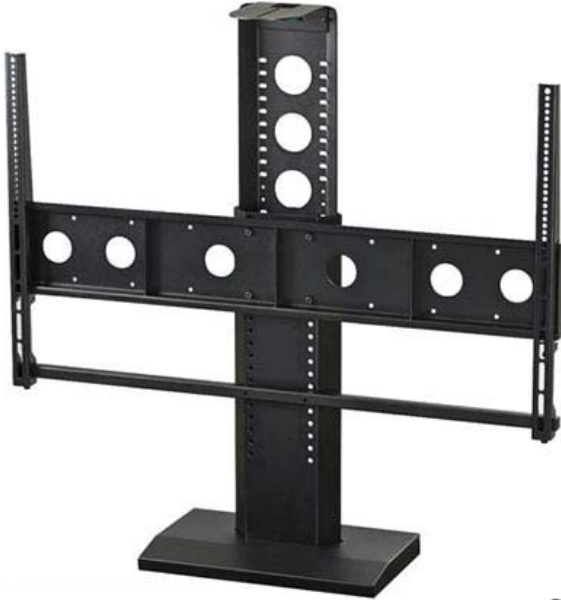
Shown with optional PM-CVR base cover