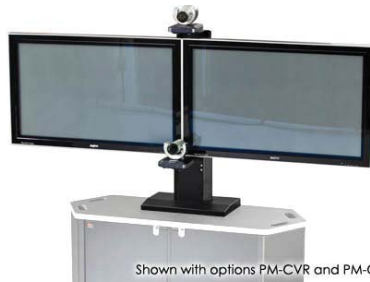
Shown with options PM-CVR and PM-CAM

The PM-D mount for dual monitors integrates with our monitor carts to provide a solid, secure connection creating a truly portable roll-about video system. Designed for videoconferencing installations, this unit features a camera/codec shelf.