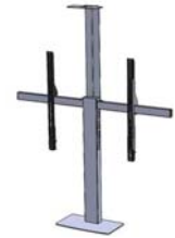
PM2-S-XL Large Single Display Mount 60" - 90" 200 lbs max