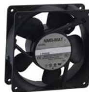
FAN Cooling Fan Quiet with 6 ft. power cord. Grills included