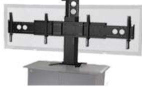
PM-D Dual Display Mount 2X 40" - 70" 160 lbs total max