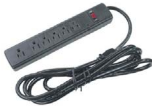
PB Power Bar 6 Outlet 110V Power Bar with 10 ft. cord