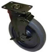
CASTER 6" Metal Caster Features grey non-marking tire. Two are locking