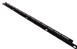
9107 Lacing Bar (19" long) Mounts to rack or sidewall