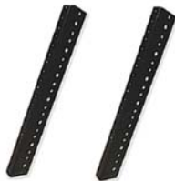
RR12-RR14-RR16-RR21 Set of Rack Rails 12U, 14U, 16U, 21U 10-32 thread (Sold separately)