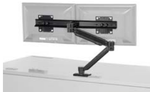
C900D Adjustable Dual Monitor Arm Edge or grommet mounting