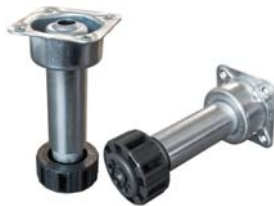
LEV4A 4" Leveler -5mm adjustment or +30mm, +70mm adjustment. Set of 4x, 5x or 6x.