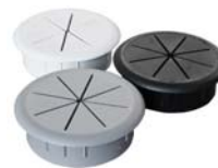
GRC60 (B/W/G) 60mm Round Grommet Black (B), White (W) & Grey (G) available. Cutout may be required.