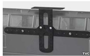
TVCB TV Mounted Camera Bracket Designed for freestanding or wall mounted TV Fits 32" - 55" TV's