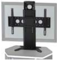
PM-S Single Display Mount 40" - 80" 160 lbs max