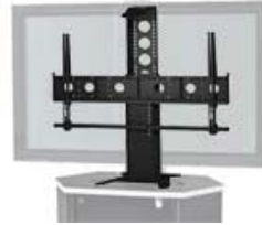
PM-S-XL Large Single Display Mount 50" - 90" 160 lbs max