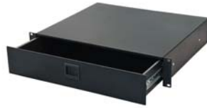
9052/2-3 Sliding Drawer 2-3 space rack mounted steel sliding drawer. Black only