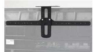
TVCB-XL TV Mounted Camera Bracket Designed for freestanding or wall mounted TV Fits 56" - 90" TV's