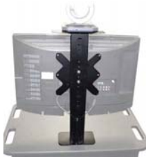
MM1232 Single Bracket Monitor Mount Fits most 12" - 32" and some 37" monitors. Camera bracket built-in. 200X200mm max.