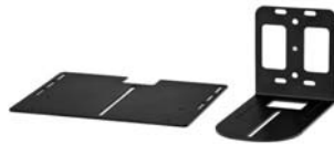
CS Camera/Codec Shelf Wall mounted