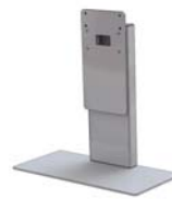
Stand60 Eye Level Camera Stand For Cisco SpeakerTrack60