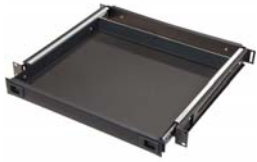
9041 Sliding Shelf Sliding rack mounted shelf Black only