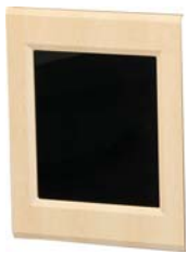
CR-A-DR Credenza Acrylic Door