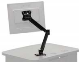
C900S Adjustable Monitor Arm Edge or grommet mounting