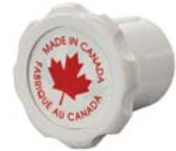
MAGKEY Additional Key for Hidden Locks Fits our credenzas (Except CR2050EX)