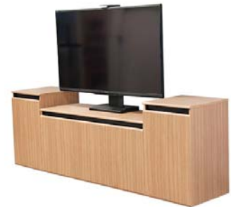
Side by side with CR3000EX (Sold separately) (70" TV shown)