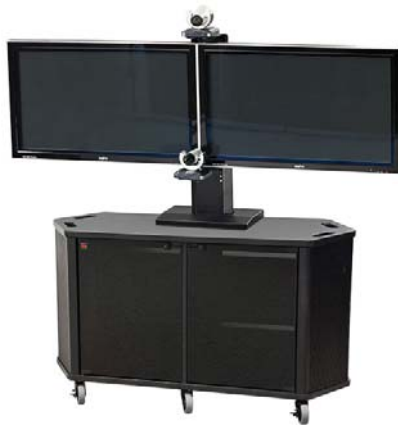
Shown with optional mount (Sold separately)