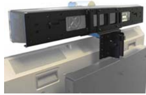
SBB Sound Bar Bracket Can be mounted above or below TV. Available for the PM series (All), TP1000 (All) & MC1000 (All)