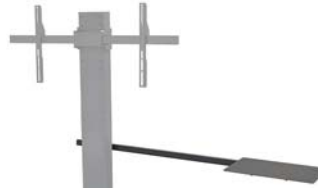
SYZ3 Metal Laptop Shelf Arm Fits AVFI stands