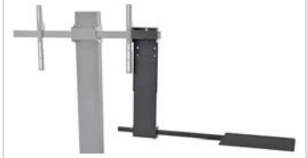
SYZ4 Metal Laptop Shelf with Hook Bracket Fits AVFI stands