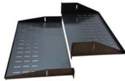
9031/1-2-3 Utility Shelf

Fits PM-S, PM-D, PM-S-XL, PM-S-FL, PM-XFL-D, PM-XFL-S, PM-XFL-LIFT, TVCB & TVCB-XL