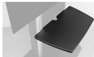
SH-TP-B Front Shelf 3/4" Black thermal wrap finish. Fits our stands TP1000 (All) & TP800 (All)