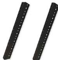
RR3-10-12-14-16-21 Set of Rack Rails 3U, 10U, 12U, 14U, 16U, 21U 10-32 thread (Sold separately)