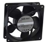
FAN Cooling Fan Quiet with 6 ft. power cord. Grills included