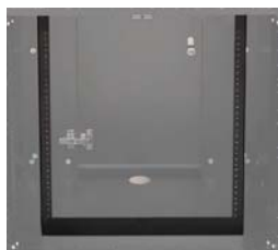
RMT12/RMT14 12U/14U Rack Frame Kit (10-32 thread)