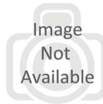
PM-S2D-KIT (flat bracket) PM2-S2D-KIT (tube style) Upgrade Kit From single to dual TV mount