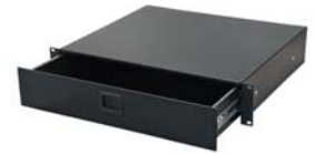
9052/2-3 Sliding Drawer

Sliding rack mounted shelf Black only Fits our carts