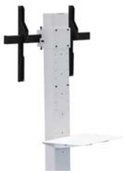
SYZ1 Metal Laptop Shelf