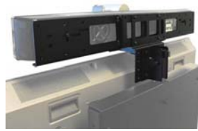
SBB Sound Bar Bracket Can be mounted above or below TV. Available for the PM series (All), TP1000 (All) & MC1000 (All)