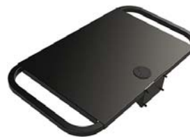
PM-DSH Work Surface with Handles Available in Black finish Fits PM-S-FL, PM-XFL-D & PM-XFL-S