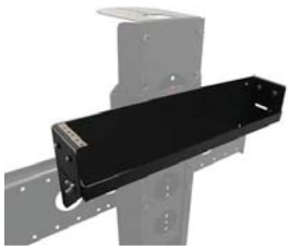
PM-2RU 2U Bracket

Fits PM-S, PM-D, PM-S-XL, PM-S-FL, PM-XFL-D, PM-XFL-S, PM-XFL-LIFT, TVCB & TVCB-XL