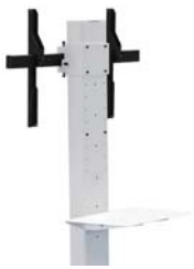
SYZ1 Metal Laptop Shelf Fits AVFI stands