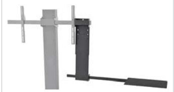
SYZ4 Metal Laptop Shelf with Hook Bracket