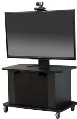
Shown with optional mount (Sold separately)