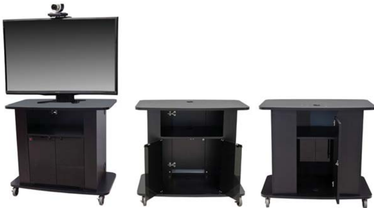
Shown with optional mount (Sold separately)