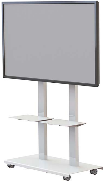
Optional 2x SYZ1 Laptop Shelf shown Sold separately