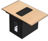
EXT32 Extension (+2 people) 48" W X 29" D X 29.13" H