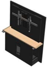
526RW-S/D/XL Section 48" W X 12.6" D X 62" H