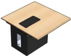
526SE Section 48" W X 46.5" D X 29.13" H

Please follow the steps below to create your own T526 Modular Table design to suit your room.