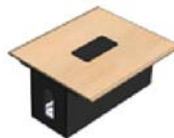
EXT34 x Qty