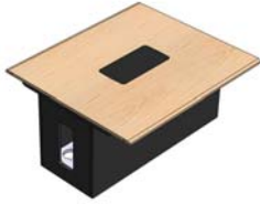
EXT34 Extension (+4 people) 48" W X 55" D X 29.13" H