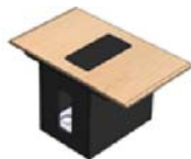
EXT32 x Qty