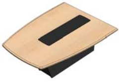
526FR Section 48" W X 67" D X 29.13" H