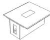
EXT34 x Qty