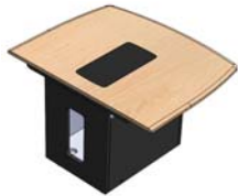
526RR Section 48" W X 37.71" D X 29.13" H