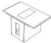
EXT32 x Qty