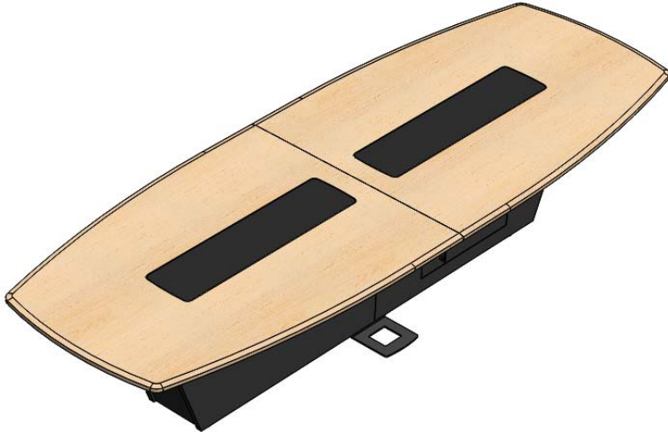
526FR + 526FR + 36BS4FR