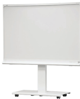
SYZ84-K with *SMART kapp 84® capture board installed