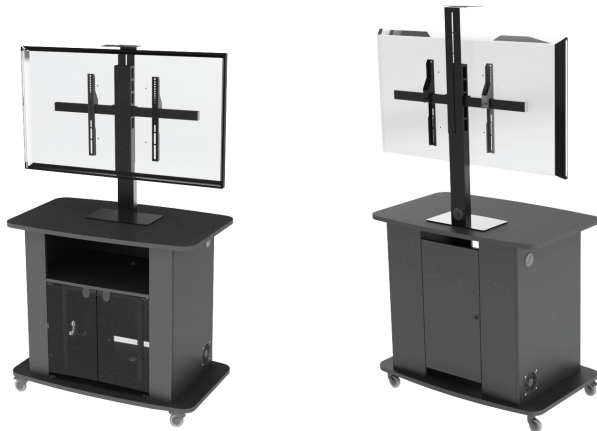
C2736-42 + Optional Single Mount