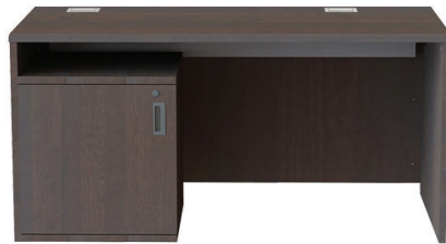
(Shown with optional PDT2224)

The multi-functional teacher/student desks are the ideal solution for classrooms. Model DSYZ6030EX features a large top surface to accommodate single teacher or two students, a wire channel and grommet organize the wires on the desk. Extra charge for custom cutouts for electronics or other items specified by the customer.