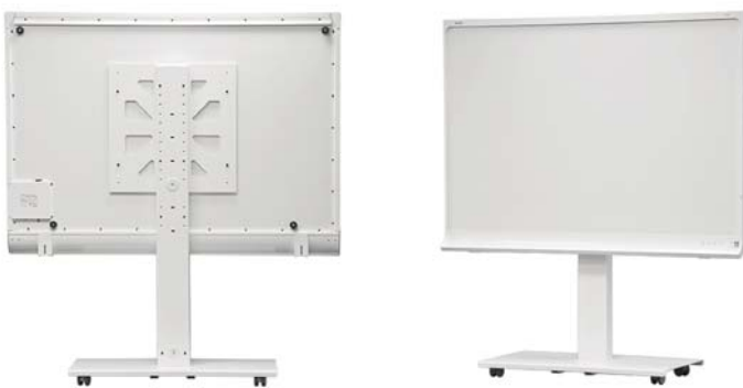
SYZ84-K with *SMART kapp 84® capture board installed