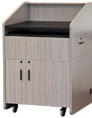
Flat Top Shown