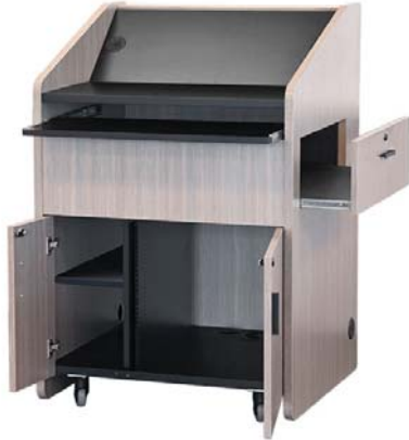
Console Top Shown

The mid sized multimedia podiums are the ideal solution for distance education, electronic classrooms and corporate training sites. Model PD3006 features a keyboard slide, a large pullout drawer with interior storage for additional electronic equipment.