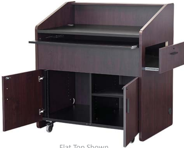
Flat Top Shown

Top rear removable, intended to easily be mounted in a wedge position or as flat large work surface, that can support monitors laptops and room control systems.