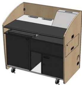
Flat + Wedge Configuration Shown

Other finishes are available. Check website.