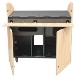
Flat or wedge top pods shown.