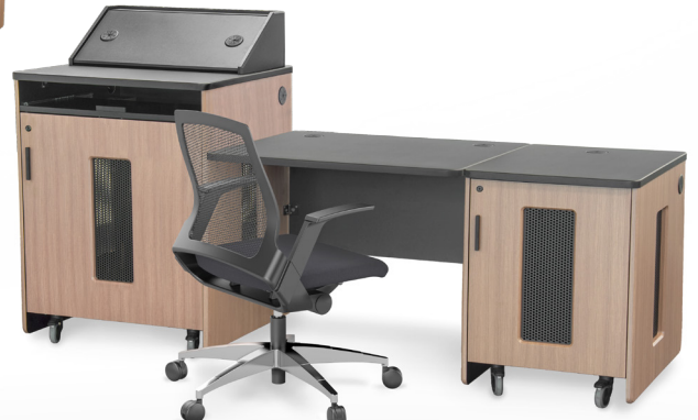
Components: PD5103, 5104TP & RK5106 Podium & rack with ADA compliant desk work surface 88.125"W x 30"D (30" height desk top)