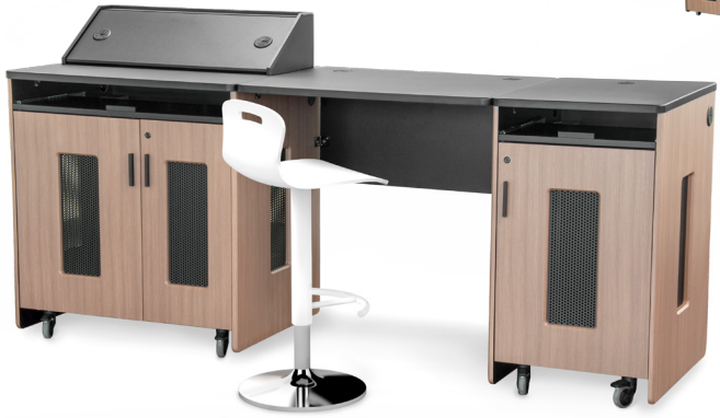
Components: PD51, 5104TP & RK5105 39" height work surface Mobile Station & rack 94.875"W x 30"D