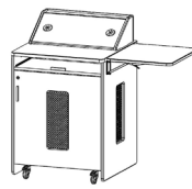
PD5103 Podium 29.75"W x 30"D x 47"H