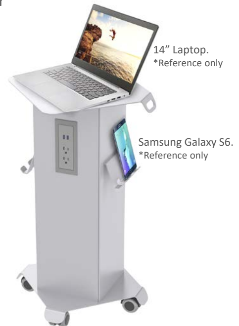
14" Laptop. *Reference only